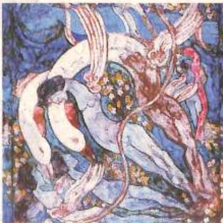
A work from 'Wings Of Desire'